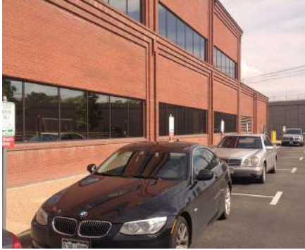
Visitor parking east of 990 S. Broadway