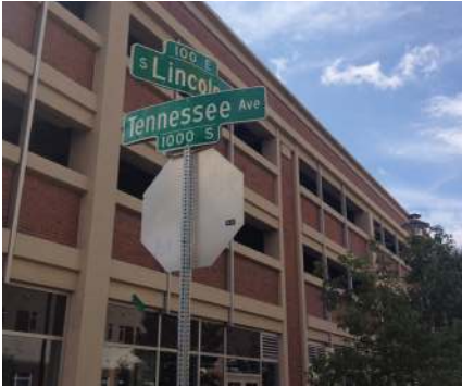
Parking garage at S. Lincoln & E. Tennessee