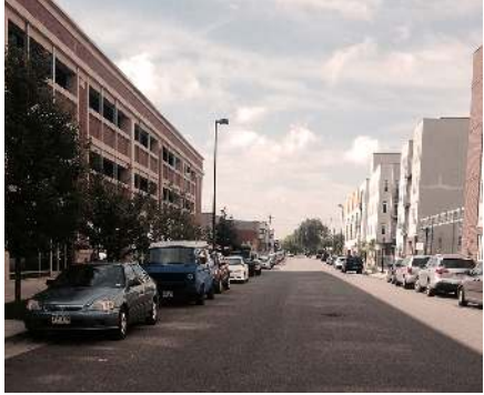
Street parking near 900/990 S. Broadway